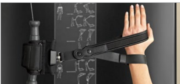
Double Loop Handle